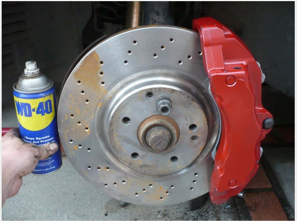
Ignore the lack of pad spring, just hadn't thrown it in yet