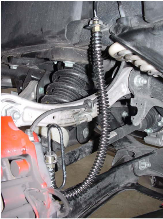
(Fig. 7) NEUSPEED Rear Brake Line shown with OE line protector installed.

7. Rear brake lines: Undo brake line fitting at inner fender and temporary cap off hard line with supplied cap. Then undo other end of brake line and remove. Install NEUSPEED lines in reverse of disassembly. Tighten brake line fittings with an 11mm and 14mm wrench. Transfer plastic line protector from original line to the NEUSPEED line. (See figures 5 – 7)