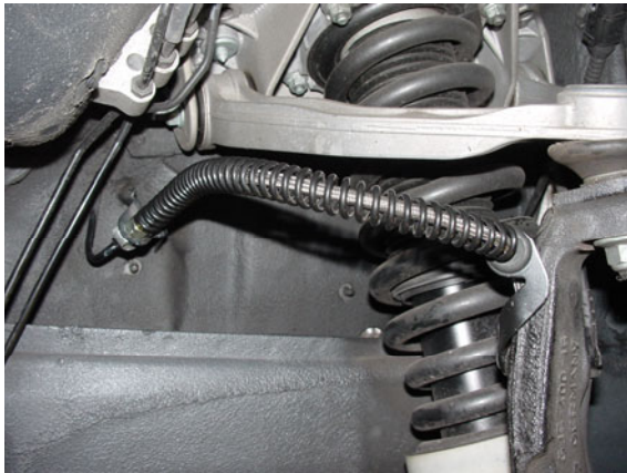
(Fig. 4) NEUSPEED Front Brake Line shown with OE line protector installed.

6. Install NEUSPEED front brake line in reverse of disassembly. With steering straight, tighten brake line fittings with an 11mm and 14mm wrench. Transfer plastic line protector from original line to the NEUSPEED line. (See figures 1 – 4)