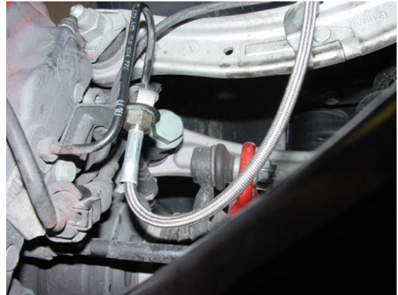
(Fig. 6) NEUSPEED Rear Brake Line shown connected to hard-line at brake caliper.