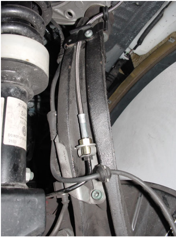
(Fig. 3) NEUSPEED Front Brake Line shown routed behind spindle.