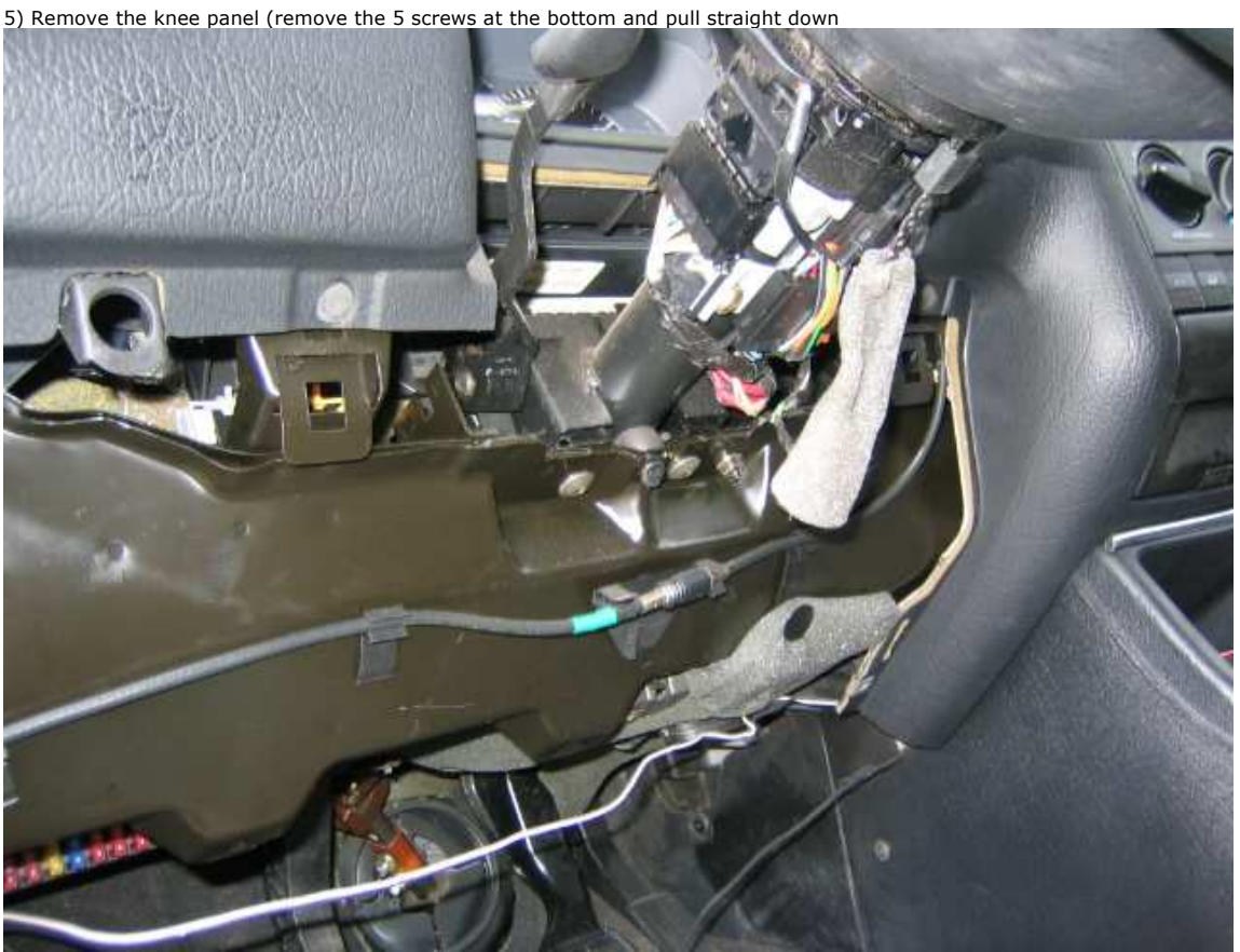
6) Unplug all (8?) wire connectors to the steering column