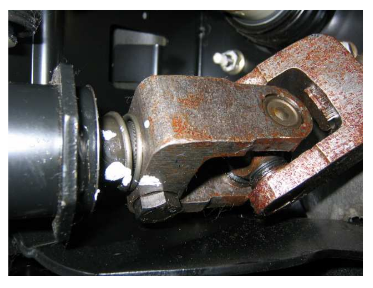
9) Okay! Use the steering wheel to pull out the column! Watch out for little spring that will drop when you pull the column out of the U-joint