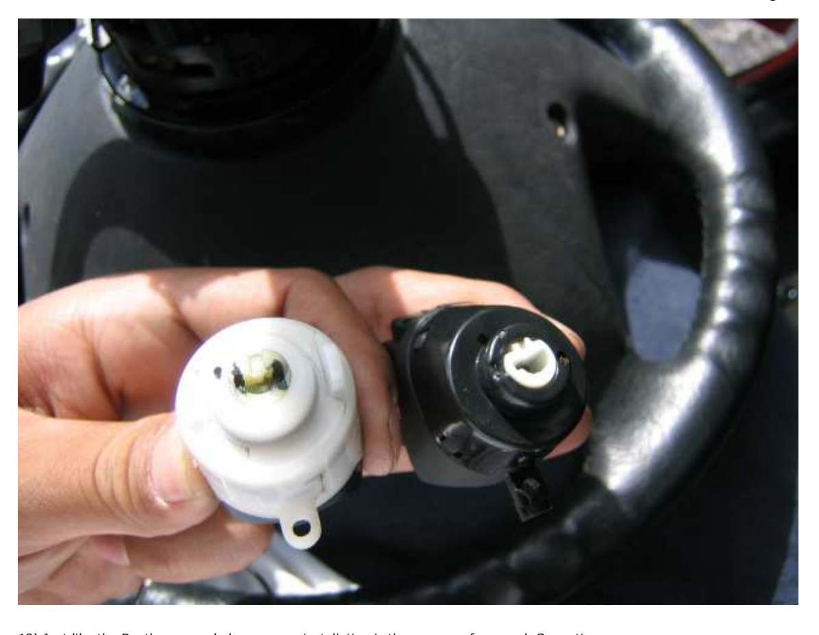
12) Just like the Bentley manual always says, installation is the reverse of removal. Some tips:

When installing the column back to the U-joint, don't forget to put that spring back in. When you put the bolt back in, take note that the steering column has a notch in it for this bolt, so you might need to slide the column either out or in to get it to line up.