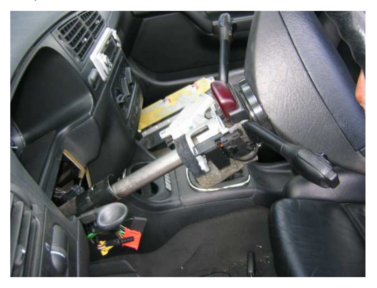
10) So this is the trickiest part. To remove the ignition switch you need that small phillips screwdriver. Based on previous posts, I didn't know how difficult this was going to be. Apparently, the only thing that will work is a screw driver from like an eyeglass/jewelers kit. None of my "small" screwdrivers fit!! I started to panic because this is my only car and I had no means to drive myself to the store to get the proper tool. I tried bending a screwdriver, and that didn't work. I DID have a jewelers flathead screwdriver. Desparate times call for desperate measures. I used the flathead and the vice grips to make myself a