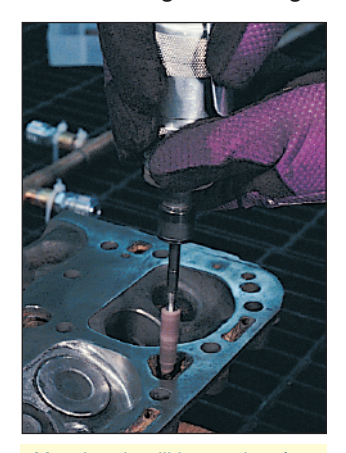
Most heads will have a lot of casting flash in the water crossovers. Use a small cartridge roll to remove that flash

As a final-touch that will enhance engine cooling, take a small-diameter, 40-grit,