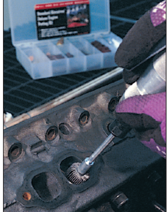
You want to flap wheel all accessible areas of the exhaust port

take the finish one step past what you put on the intakes. Use the flap wheel on every part of the exhaust port you can reach.