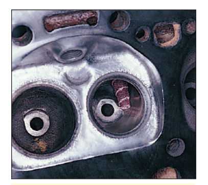
In some cases, depending on port length and the position of the valve guide, it may be necessary to switch to the long cartridge roll mandrel and work on the guide through the intake port entry or the exhaust port exit. A full-taper cartridge roll works best for that.

263351); large, 40-grit half-tapered (part no. 263751) or 40-grit, full-tapered (part no. 263301) cartridge rolls. Again, you start with 40-grit and switch to 80-grit.