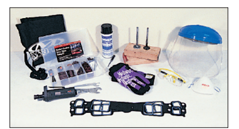
This display shows all the items one needs to port a set of heads the easy, Standard Abrasives way.

The first items you need are our Standard Abrasives Deluxe Porting Kit and our Standard Abrasives 3-inch