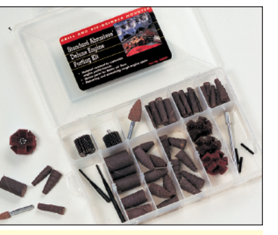
The components of the Porting Kit are neatly packed in a compartmented box. There are enough abrasive materials to port a set of V8 heads.