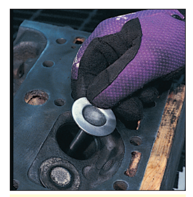
Before doing the chambers, install a set of valves to protect the valve seats

Most important to remember during chamber work is that you want to remove as little material as possible. Every bit of metal you polish away increases chamber displacement a tiny bit and reduces your compression ratio a corresponding amount. For that reason,