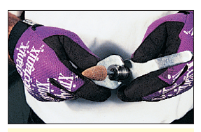
Tool changing is the first die grinder skill one learns. Most die grinders use the type of chuck that is tightened with two open-end wrenches.

The point of this exercise is to get a feel for the die grinder fitted with different tools. Prior to starting your practice, use the wood blocks to support the head in a manner that makes the head deck and intake and exhaust port surfaces easy to reach. Lift up the head and place a block between your work bench and a head bolt boss or other surface of the head that will sit on the block.