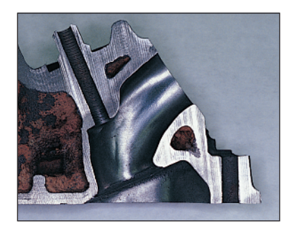
This is a finished exhaust port. Note the smoothed valve guide and short side radius. Also, note the finish is significantly different from what we saw on the intake cutaway.

Begin working the exhaust port with the medium Cross Buff. Once you have hit as much of the port as you can with the medium, make a final pass with the red, 3-ply, 1 1/2-in. very-fine-grade, Cross Buff (part no. 265056). When you are done, the exhaust port walls will have that near-mirror finish that will resist carbon deposits.