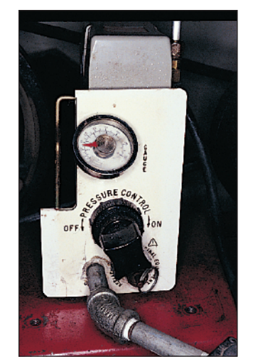
This particular air compressor has a built-in pressure regulator. The pressure control on the panel selects the regulated pressure. The gauge on the panel reads regulated pressure not the tank pressure. If you use an air grinder, whatever compressed air source you use should have an adjustable regulator.

An air-powered die grinder is desirable because of its relatively low cost and variable speed. An air grinder will require a compressed air source. Most compressors