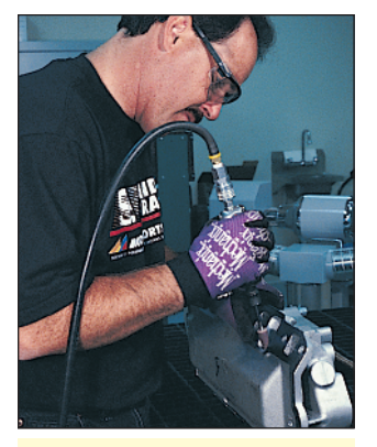
The port matching of the intake is accomplished like that of the intake port entries in the head. If a lot of material needs to be removed, start with the rotary stone, otherwise, use a 40-grit cartridge roll. Remember to use less pressure on the grinder because aluminum abrades quicker than iron.

basic port project on an engine with an aluminum manifold, remember to use a more gentle touch than you would if you were working cast iron.