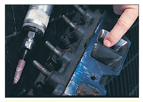
Best way to gauge the finish on the port walls is with your finger. For intakes, you want the surface slightly rough to the touch but without waves, gouges or low spots.