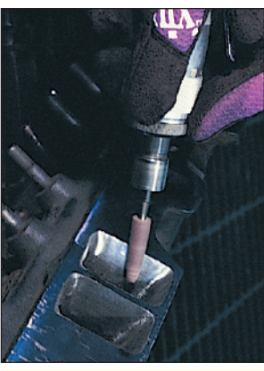
You start with 40-grit rolls and progress to 80-grit. In many intake ports, the small-diameter rolls will be needed to finish the radii at the corners of the port. Typically, you polish only 1-1.5 inches down the port.

Once you have worked the port entry with 40-grit, switch to the large, straight 80-grit cartridge roll (part no. 263163). The 80-grit gives you the smooth, but not