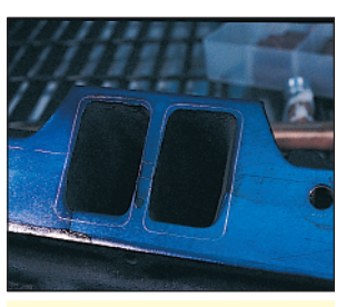
Machinist's blue, in this case sprayon Dykem, is applied to the area surrounding the intake port entries in the head.

To ensure the head port entry and the intake manifold port end up the same size, you scribe an outline of the intake gasket openings on the head and the manifold.