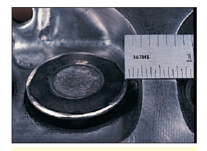
This particular head did not have an exhaust valve shrouding problem; however, heads with small chambers and big valves may have the problem. The easiest way to check for it is to hold the valve open about 3/8-inch and use a ruler to measure the distance between the valve edge and the chamber wall.

"shrouding" occurs when, at high valve lifts, exhaust flow is impeded by the closeness of the chamber walls to the edge of the open exhaust valve. Shrouding is common with pre-1971 Chevrolet small- and big-block V8 and early 289/302 Ford Windsor heads. At .300-.400 valve lift, there should be 3/16-in. or more between the edge of