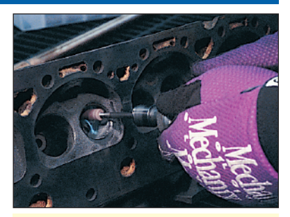
Bowl work is the second part of the basic porting. Here a half-tapered cartridge roll is used to smooth the valve guide. While this picture shows work on an exhaust port, the valve guide work is the same be it in an intake or an exhaust.

may need to switch to the long mandrel (part no. 269149). Start with the small diameter, 40-grit straight cartridge rolls (part no. 263021) and, depending on the location of the radius and the tool angles necessary to approach it, you may also need to use small, 40-grit, halftapered (part no.