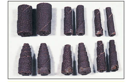
The Cartridge rolls in the Standard Abrasives Porting Kit come in a wide variety of shapes and sizes.

Disconnect the grinder, remove the stone and install the short cartridge roll mandrel (part no. 269111). Cartridge rolls come in a variety of sizes and