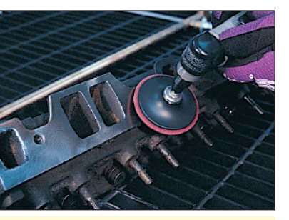
The solution is the Surface Conditioning discs in Standard Abrasives Gasket Removal Kit. They abrade the surface down to bare metal but do no damage in the process.

The Standard Abrasives' 3-inch Gasket Removal Kit is the proper way to condition the gasket surfaces without damaging them. It contains surface conditioning discs for use on cast iron and aluminum along with a holder pad that attaches to your die grinder.