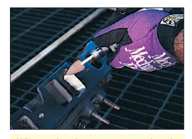
by removing material inside of the scribe marks you made. Then, you'll blend or "feather" the now larger port opening into the remaining port by removing progressively less material as you move down into the intake port. In most cases, you want to grind