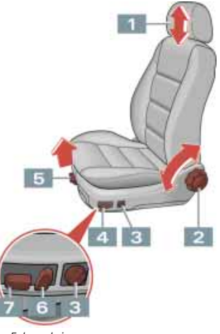
Enlarged view: Electric seat