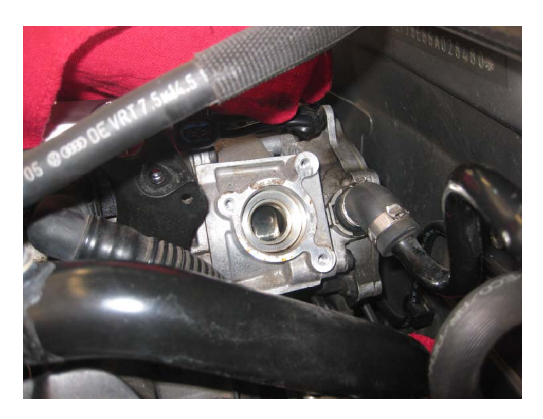
Here is a snapshot of the fuel pump.