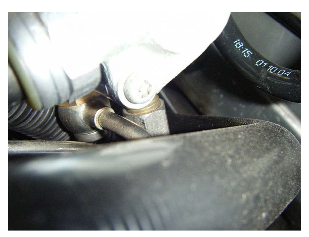
9. First, remove the high pressure line. Make sure to stuff a paper towel/work rag underneath the fitting to catch any fuel spray and drips. Use a 17mm open wrench. Suggestion: use a short wrench so that you can easily maneuver it under the coolant line, electrical wires and hoses. The fitting isn't too tight so the force applied to twist it is minimal.