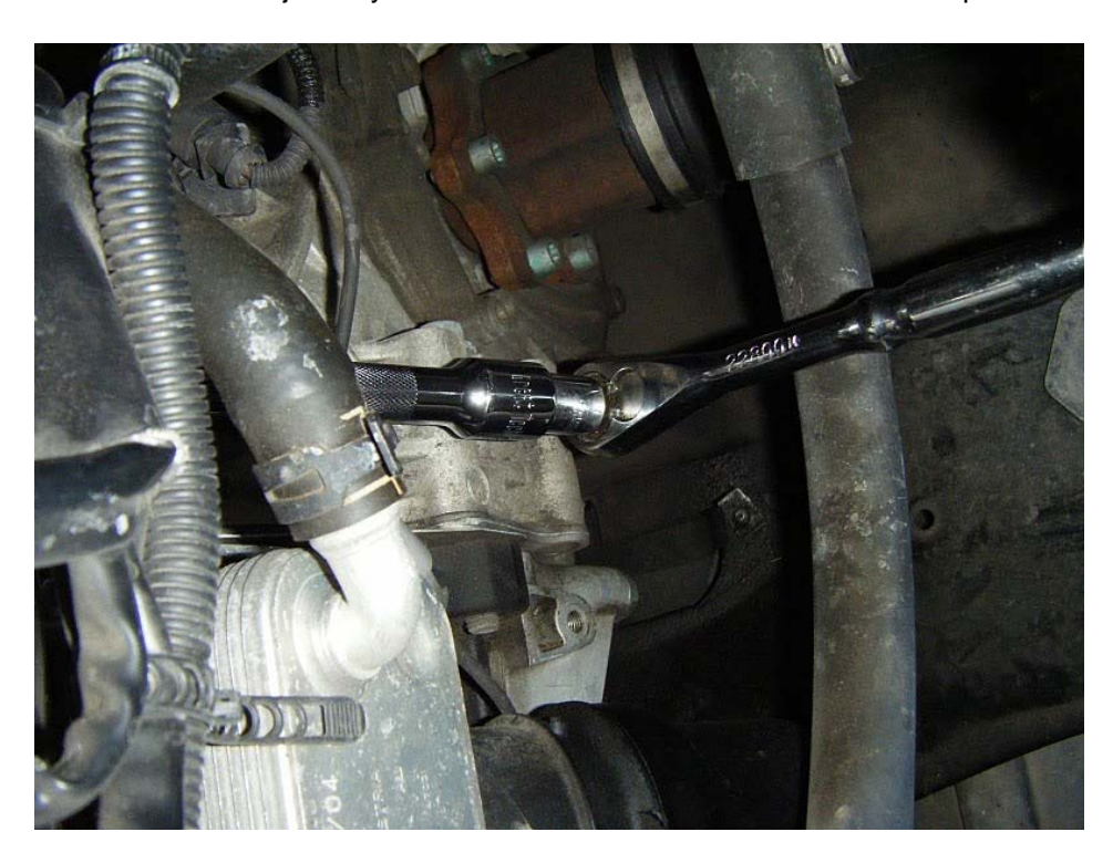
Here's a setup used on the ratchet to reach the banjo bolt by the person who took the photos. Once again, I used something very similar.