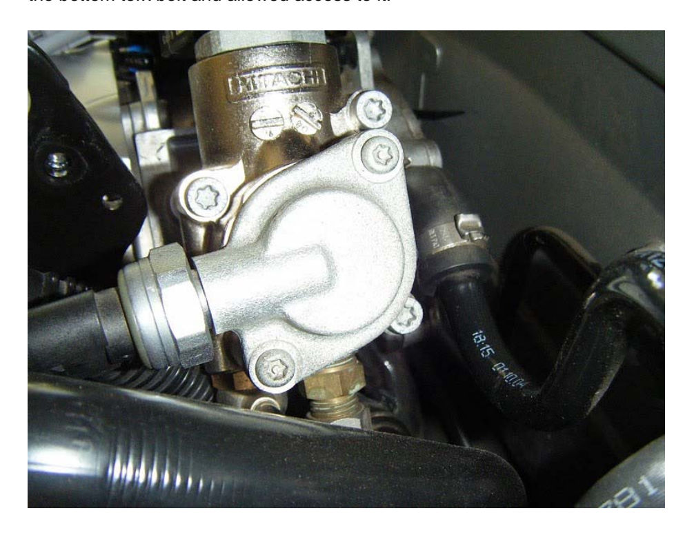
A sample setup to be used to remove the torx screws holding the pump pictured in the photo below. I used something very similar. Do not remove the torx bolts just yet!

8. Remove the fuel relief valve from the side of the pump. To do it, simply twist off the plastic cap and use a 17mm open or closed wrench to undo the valve fitting. Have some work rags handy as some fuel will pour out. The reason you need to take it out is to gain access to one of the T30 torx bolts that hold the pump in place. Below, is a photo of the top view of the pump with relief valve removed, which exposed the bottom torx bolt and allowed access to it.