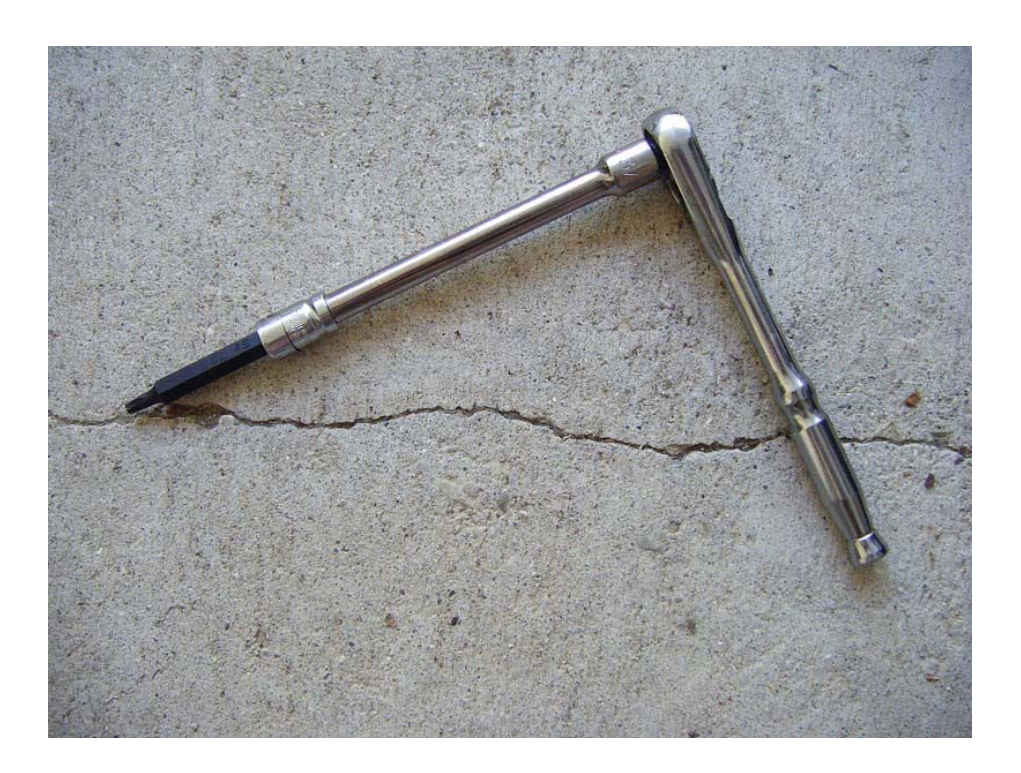
This shows the input banjo bolt fitting on the left, and the output compression fitting of the line to the fuel rail on the right. Note the complete lack of access for the banjo bolt.