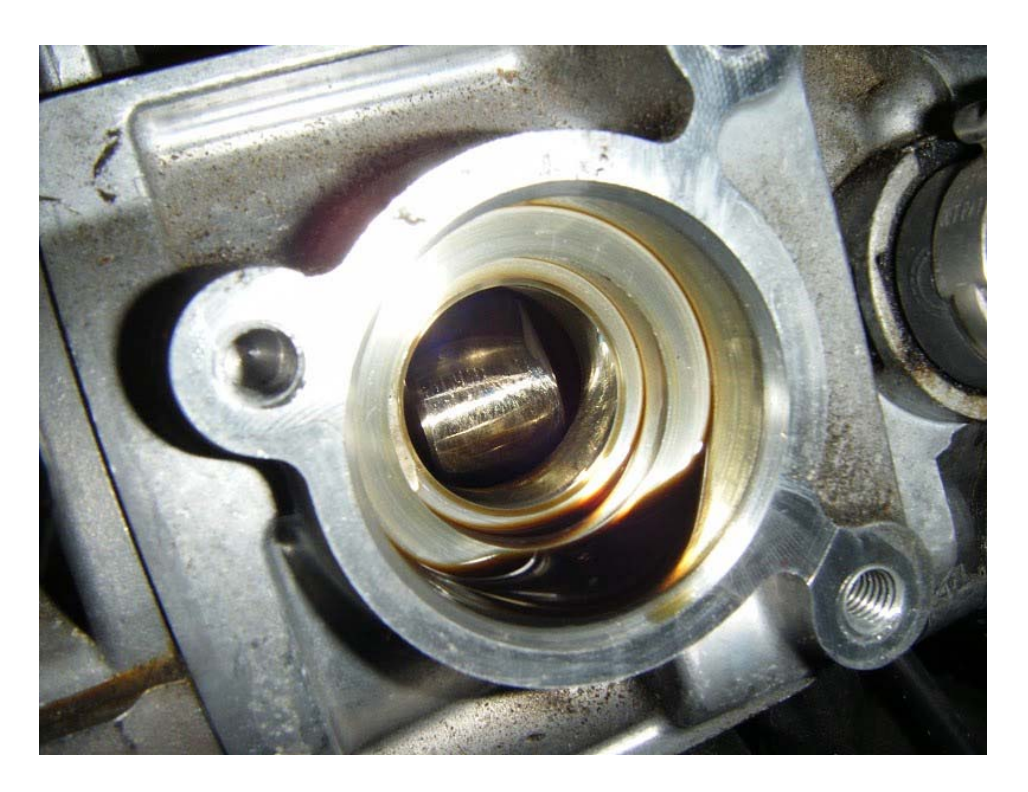
15. Cover the valve cover opening with a clean cloth or paper towel to prevent any dirt from getting inside.