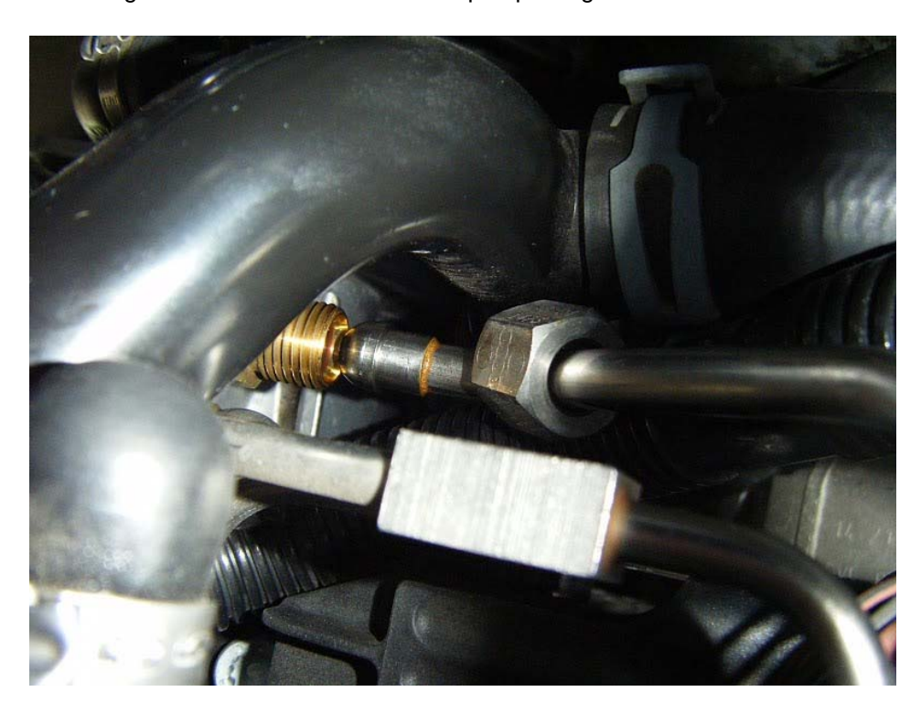
10. Now, using 12-point 8mm torx bit remove the banjo bolt from the pump