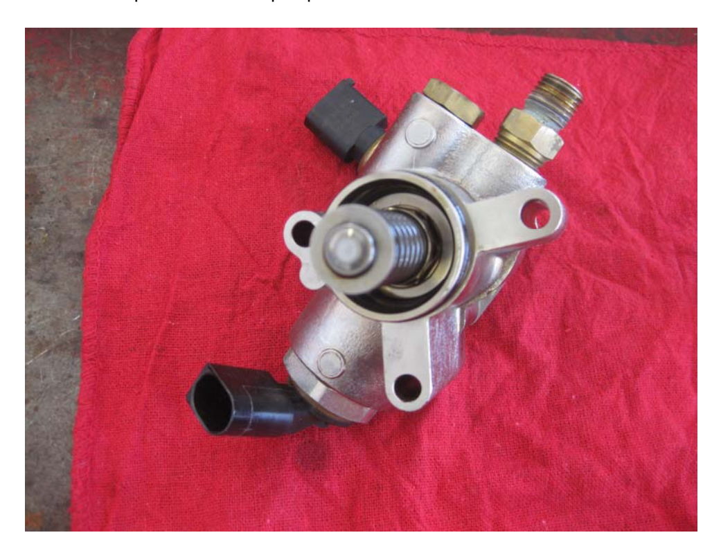
16. Per Bentley manual it is recommended that you replace the round fuel pump seal. The following photo shows the seal to be replaced. Audi part number for the seal is 06E 127 248. It costs $9.68 from my dealer.