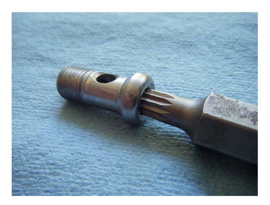
To remove the banjo bolt you need to reach from the bottom like in the photo below: