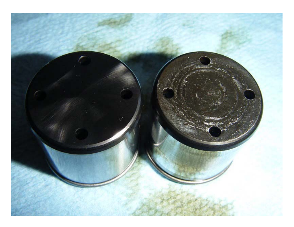
Here're my awkward twins: