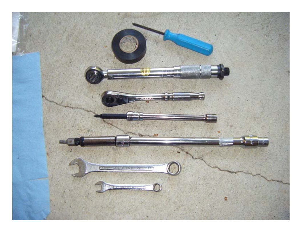
Here's a picture of the tools I ended up using