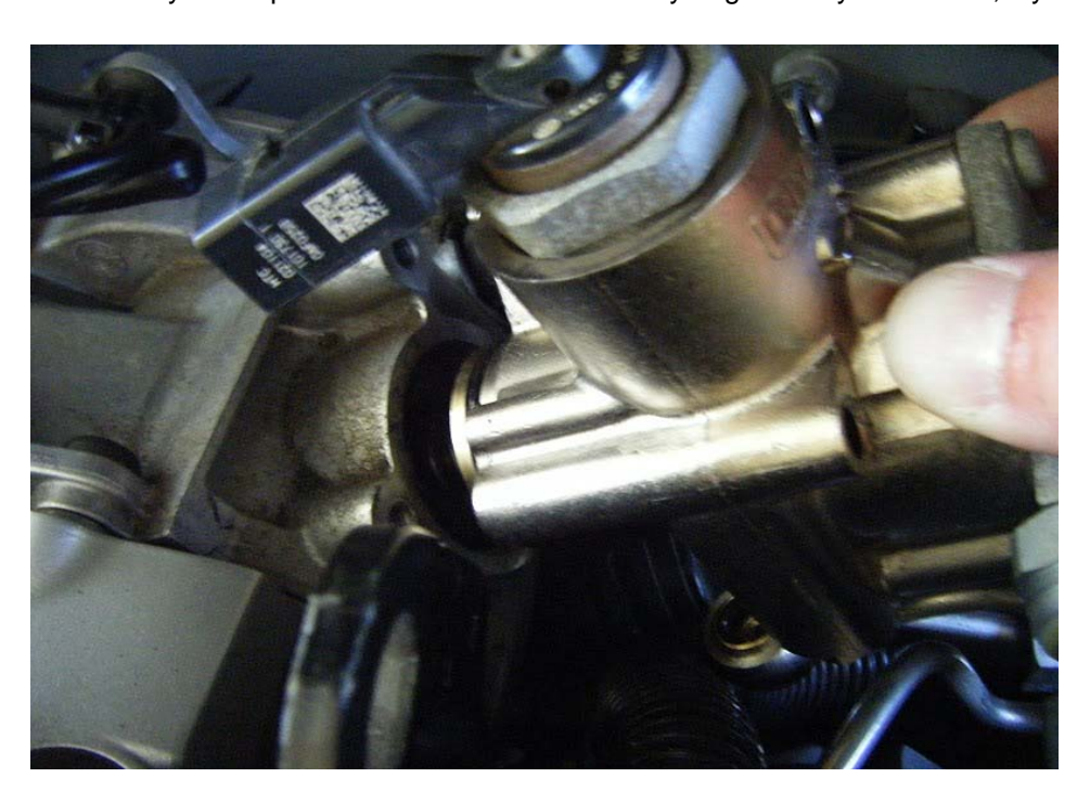
14. If the cam follower is still in the valve cover, carefully remove it with your finger.