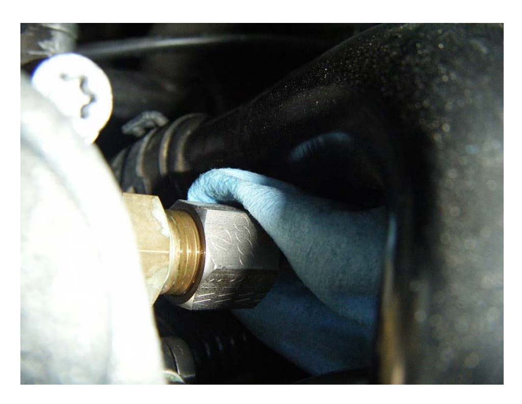
The fitting is off and the line is out of the pump fitting: