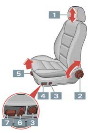
Enlarged view: Electric seat