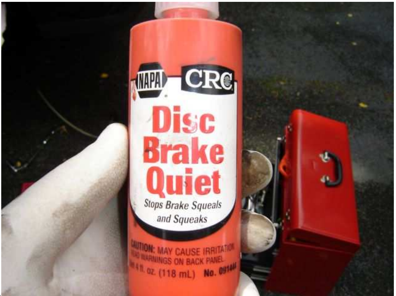
only a little.