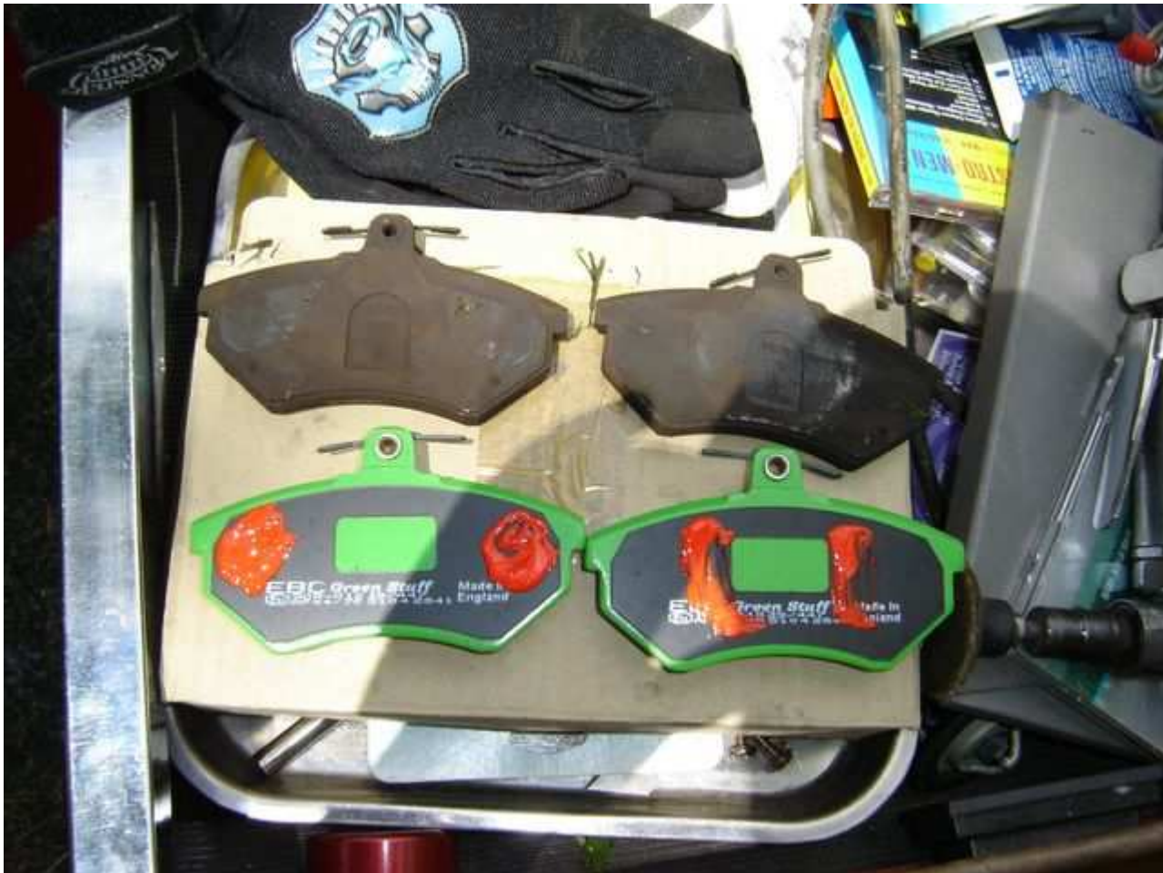
Silly monster garage gloves