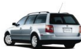
► Passat GLS Wagon M.S.R.P. $22,550*