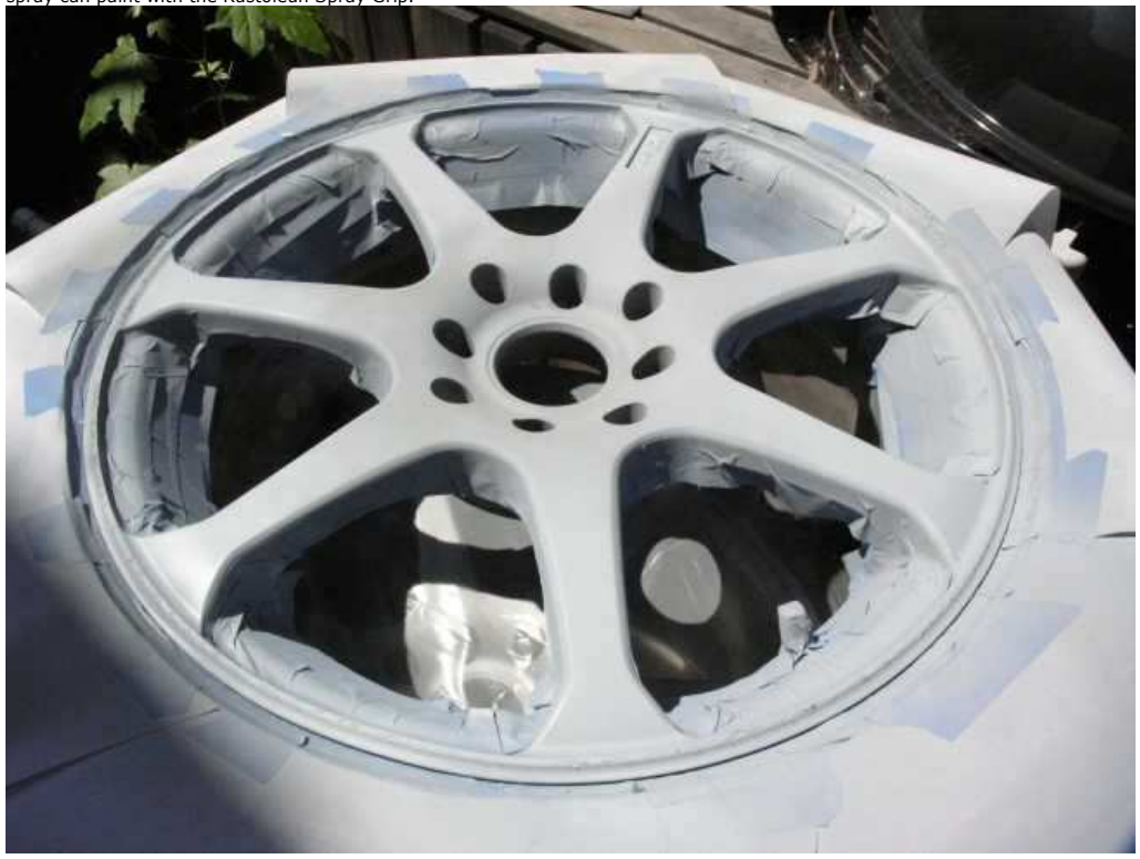
Note: I highly recommend using something like the Spray Grip (I'm sure there are other brands).