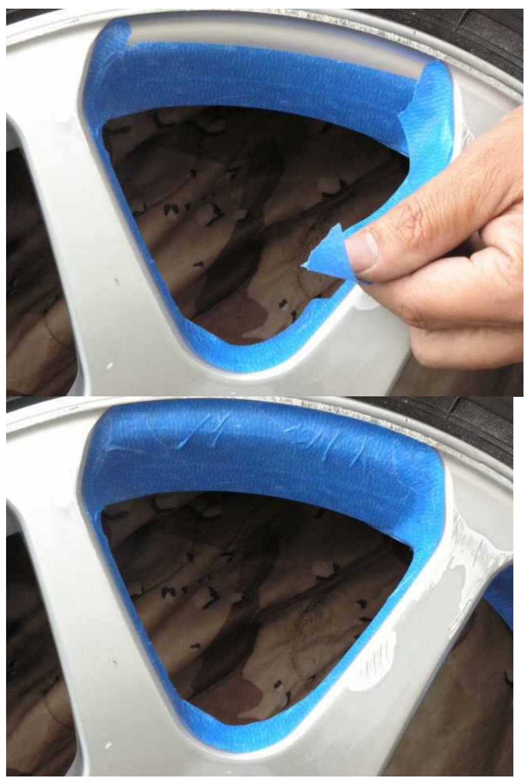
In my case there were natural areas where I could paint to w/out it looking like crap.

This did mean taping off each spoked section (7 total/rim) I did it slowly using small sections of masking tape.