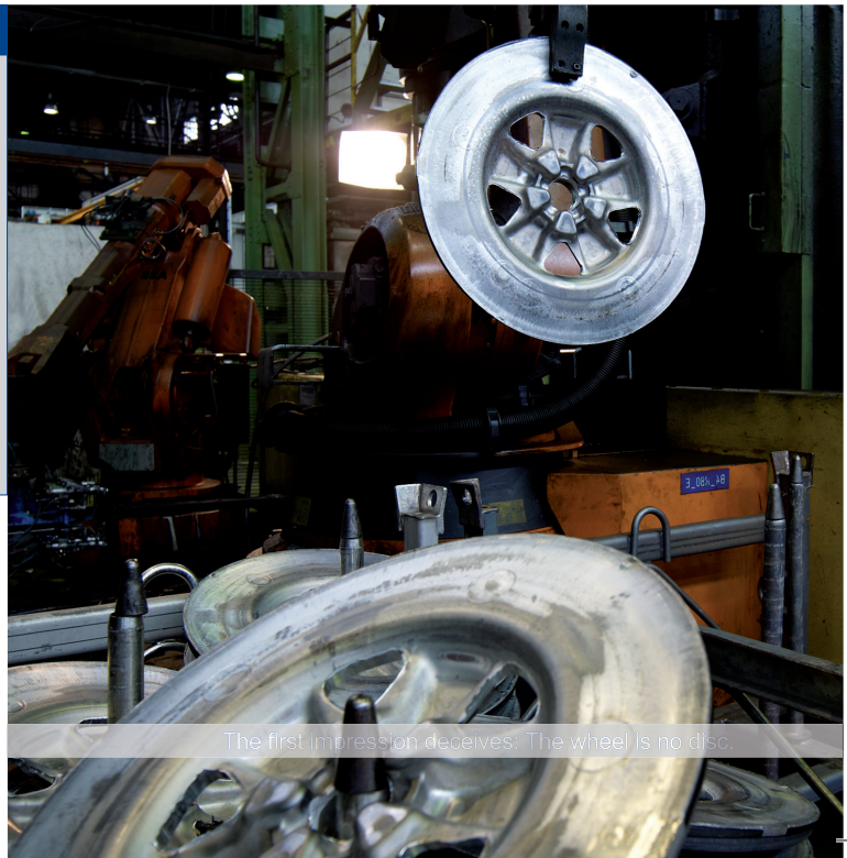
The first impression deceives: The wheel is no disc.