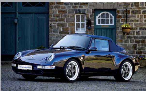
Since the 1960s a must have for the Porsche 911 and from 2012 in 17" and 18" for the type 993 as well: the Fuchsfelge.