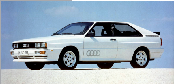
The Audi Ur-quattro: the pioneer with the first standard all-wheel drive in a sports coupe - and of course with Fuchs wheels.