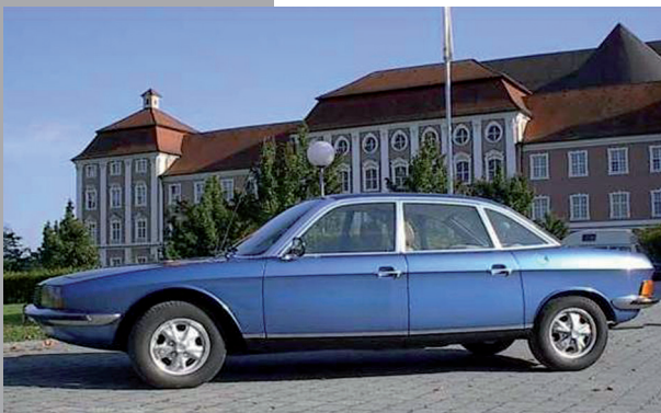
The NSU Ro80 convinces with its aerodynamic body and its 'shapely legs' - the Fuchsfelge.